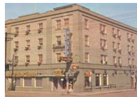
Crown Point Hotel, circa 1964

buildings and businesses as they once looked and hope current businesses in the same location will be interested in having these photos in their place of business. We have prepared a portfolio of the selected photos for the business to choose from and will be going door to door to seek potential purchasers. Once a photo has been purchased it